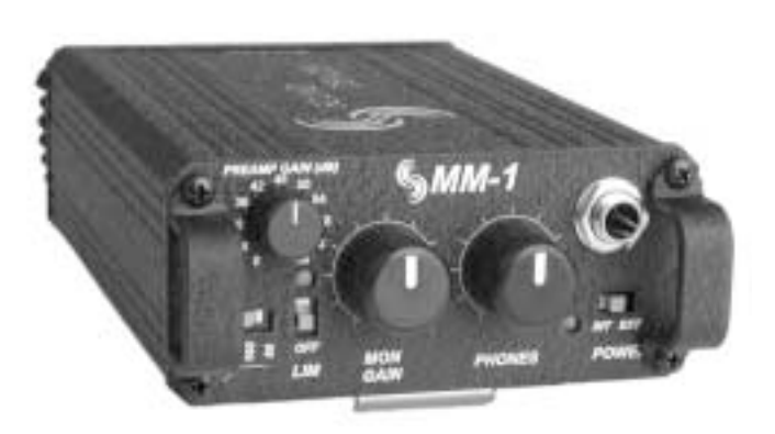
Sound Devices MM-1

Sound Devices has delivered many useful products for the production sound engineer. The MixPre, MP-2 and USB Pre are among a highly regarded product line known for great sound, small size and rock solid reliability. While the soon to be released 442 4-channel Field Mixer is receiving a lot of attention, there are a couple of other new Sound Devices boxes to be introduced at AES that shouldn't be overlooked.